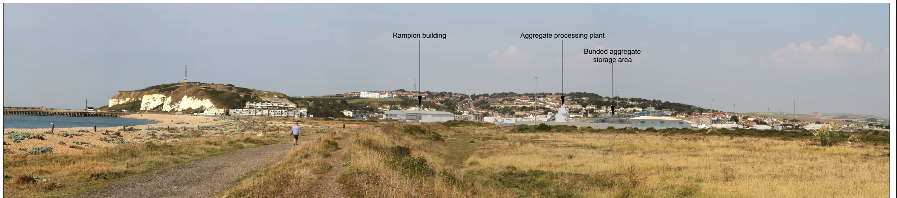
Viewpoint Location 1: Showing Stage 1 development