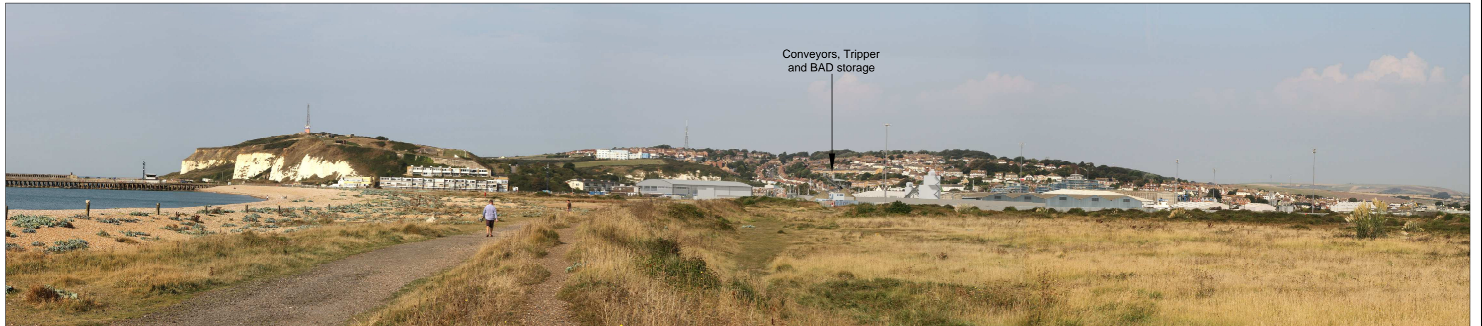
Viewpoint Location 1: Showing Stage 2 development